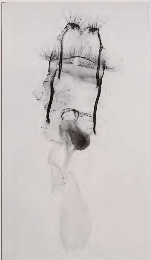
Fig. 5. Titanio caradjae (Rebel, 1902) comb. n. , ♀ genitalia (GU Nuss 781-97).

Distribution. – Only known from the type locality Kulp (= Tuzluca, Prov. Igdir, Turkey) and the eastern Toros mts. (Prov. Kahramanmaras, Turkey).